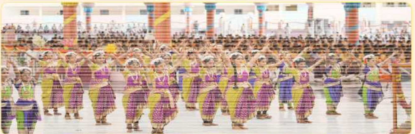
Welcome dance by the girls from Sri Sathya Sai Vidya Vihar High School, Hyderabad