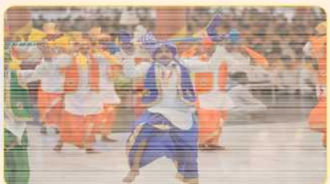
Bhangra Dance by Sri Sathya Sai Jagriti Vidya Mandir, Darwa, Haryana