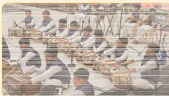
Musical feast presented by the students of Sri Sathya Sai Vidya Vihar, GAIL, Vijaipur, Madhya Pradesh