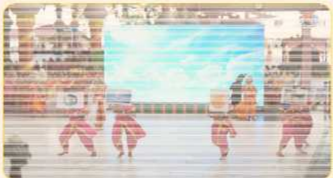
Dance drama – Jaladhara, by Sri Sathya Sai Vidya Vihar, Macherla, Andhra Pradesh