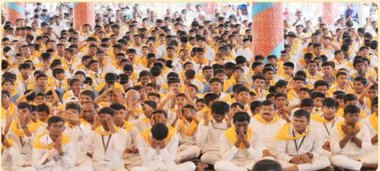
Boys from various Sai Schools across India