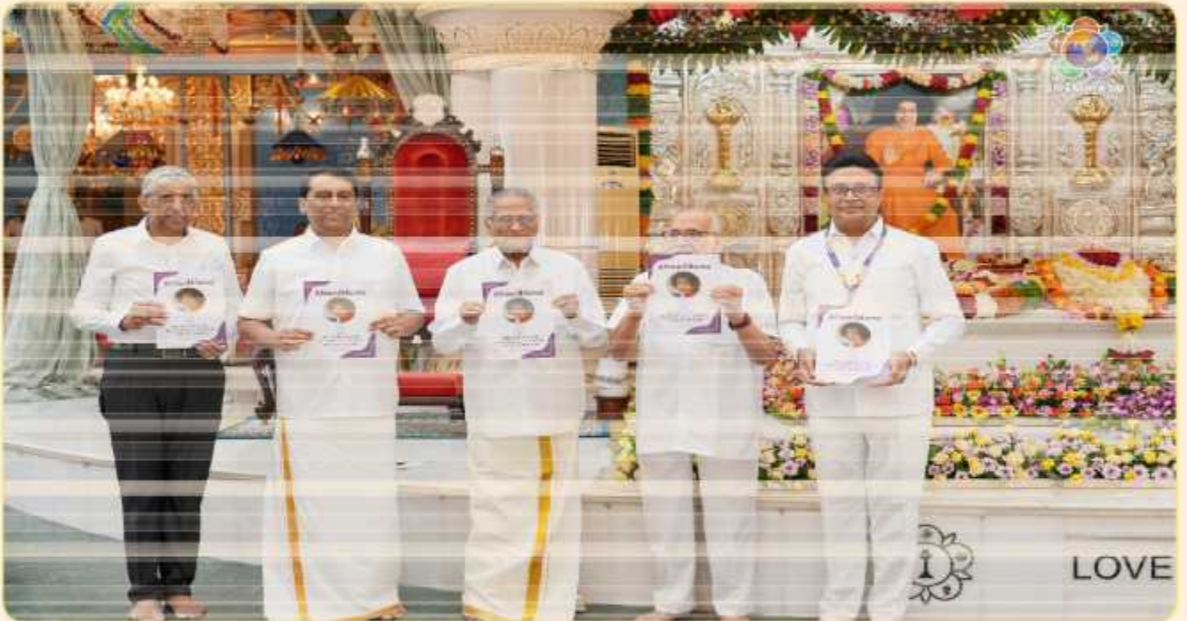
The revered trustees and functionaries released the bi-annual newsletter 'Atmodbhava'