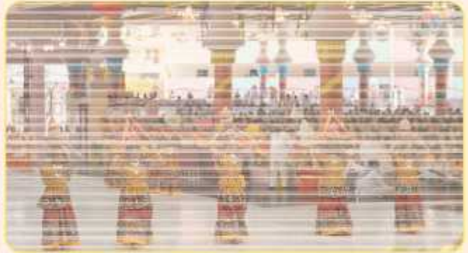
Garba performance by girls from Sri Sathya Sai School, Surat, Gujarat