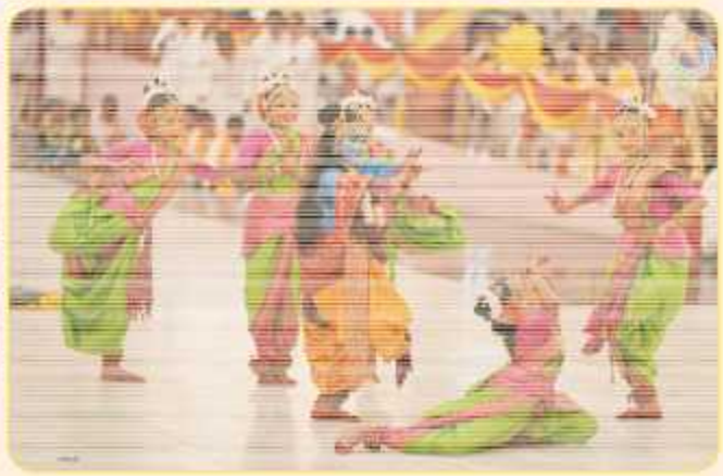
'Swagatam Krishna' dance performance by girls from Sri Sathya Sai Vidya Vihar, Parlakhemundi, Gajapati, Odisha