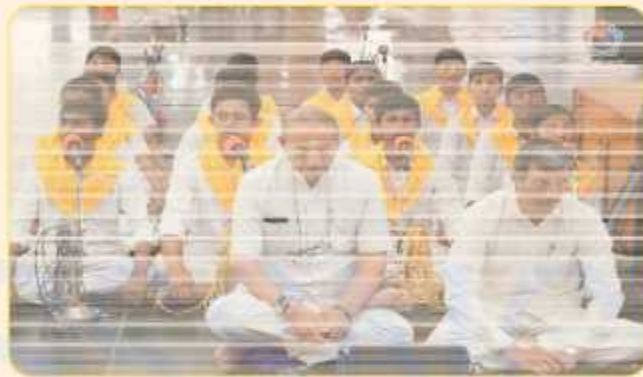
Vedic chants by the boys from Sri Sathya Sai Gurukula Vidya Niketan, Bejjanki, Telangana