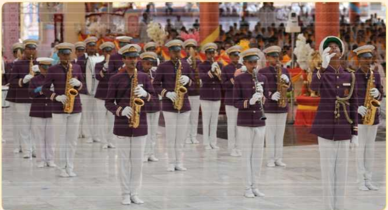
Boys band of Sri Sathya Sai Vidya Vihar, Visakhapatnam