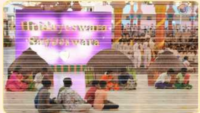
'Hrudyeshwara Saieeshwara' by the students of Sri Sathya Sai Institute of Educare, Chennai, Tamil Nadu