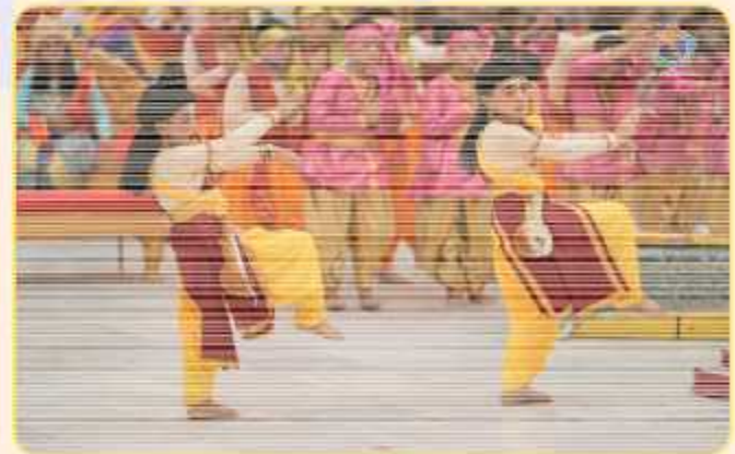
'Ramakatha' by Darjeeling Montessori House of Children, Darjeeling, West Bengal