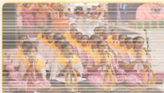
Vedic chants by the girls from Sri Sai Matriculation Higher Secondary School, Tirupur

Followed was a musical feast – a delightful and seamless ensemble of instruments presented by the students of Sri Sathya Sai Vidya Vihar, GAIL, Vijaipur, Madhya Pradesh. Aptly titled 'Sai Symphony', the children poured their hearts into a devotional instrumental performance that lifted the spirits of the gathering, harmonising rhythm, melody, and devotion into a single offering.